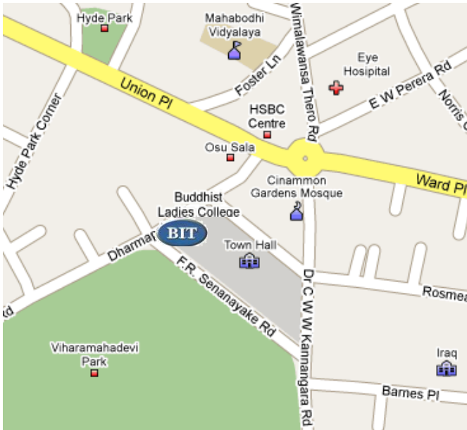
Figure 2: External Degrees Centre (EDC) of UCSC

EDC is located at 221/2A Dharmapala Mawatha, Colombo 07. Refer Figure 2 for the location of the BIT office.